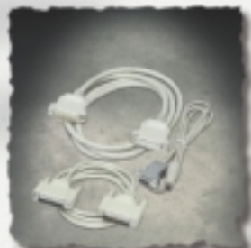
S. CBL625F25M P. CBL625F25M-STR