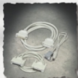
S. CBL625F25M P. CBL625F25M-STR